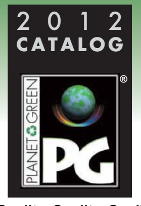
Quality. Quality. Quality.